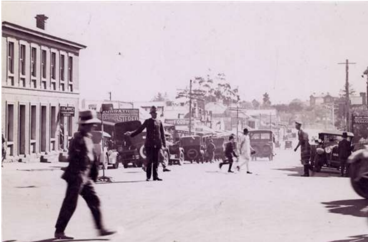
(Gray Street Corner looking down Thompson Street (towards Melville Oval) c/Late 1924,)

Thought for the first This & that of 2025, for something different, we would re-visit Hamilton in 1925 and what was going on around the town car wise.