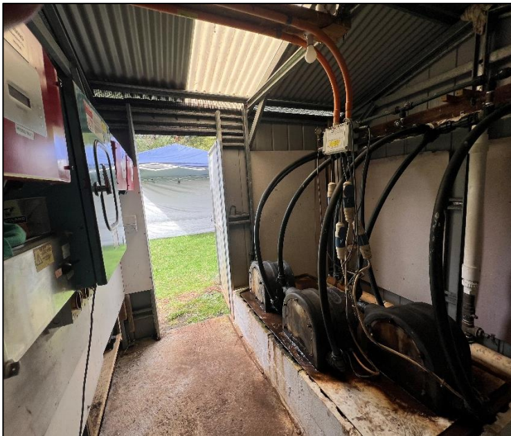
Club run to Ivor Awty's Hydro Electric Scheme