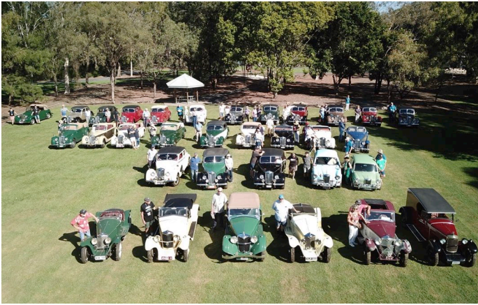
Group photo at the Botanical Gardens