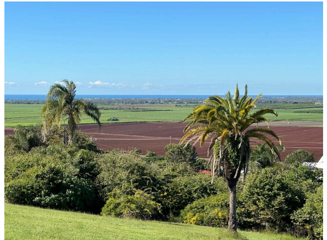
View from Hummock Lookout

Sanctuary and to the Bargara Golf Club for lunch with its beautiful coastal views.