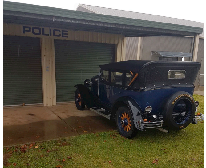
Somehow the Clouts ended up in the police compound at the Pre 31 Rally!!