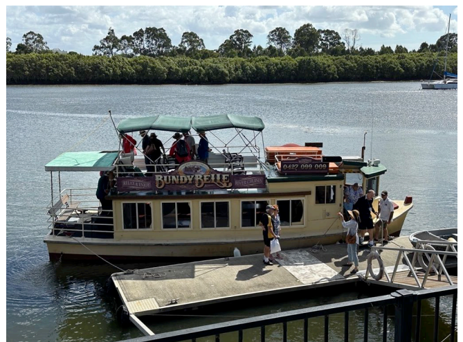
The "Bundy Belle"

Wednesday morning, we went on a 3-hour cruise on the "Bundy Belle" on the Burnett River. After lunch we visited the Hinkler Hall of Aviation & Hinkler House in the Botanical Gardens. The mid rally dinner was held at night.