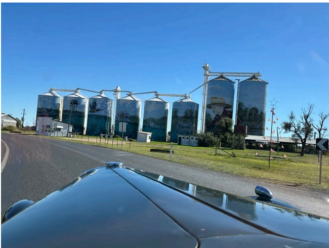
Passing Yelarbon Silos near Goondiwindi on the way home