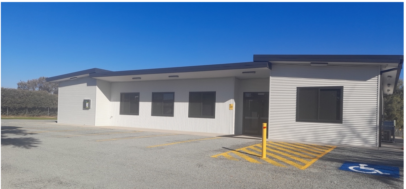
The new Shaw Street Community Hall – home to WWVVMC and U3A

The new building is a Council owned Community Hall which the Club and U3A lease. The public can also lease at vacant times.