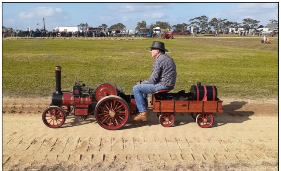
Heyfield Vintage Machinery Rally