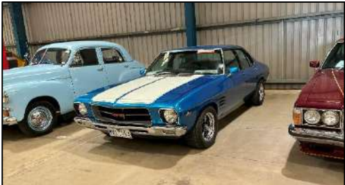
Heritage Vehicle and Machinery Display