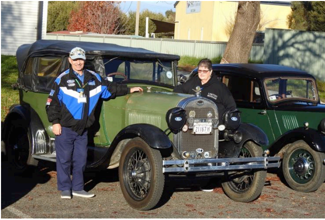
Entrants' cars at the clubrooms