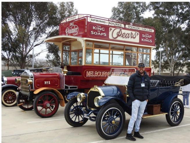
Vehicles on display at The Range Function Centre

Sunday started with the soup stop before heading out on a short drive to the Range Function Centre for our display of vehicles – the weather was not so good.