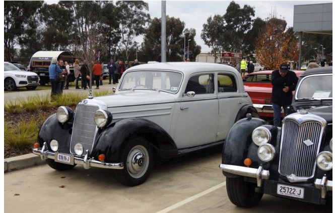
Vehicles on display at The Range Function Centre