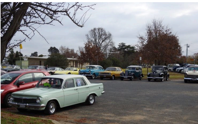
Entrants' cars at the clubrooms and down the street