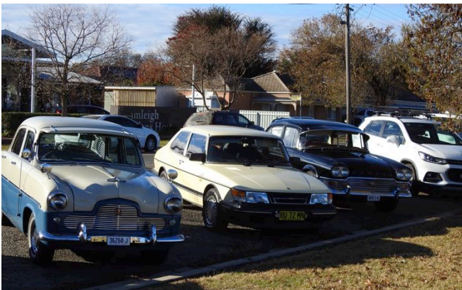
Entrants' cars at the clubrooms