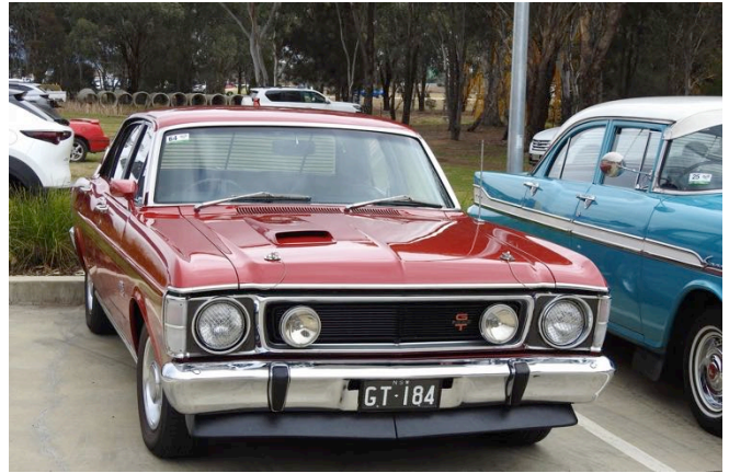
Vehicles on display at The Range Function Centre