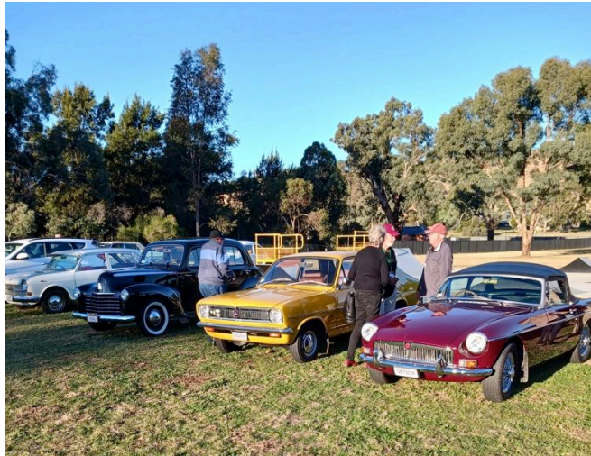
Parked on the grass at Oura Hall enjoying a walk around and beautiful afternoon tea

On the drive home we stopped in at the Oura Hall for afternoon tea, and a sit around in the late afternoon winter sunshine.