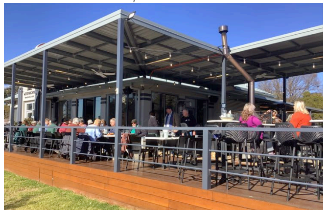
Members mingling on the Pub Verandah