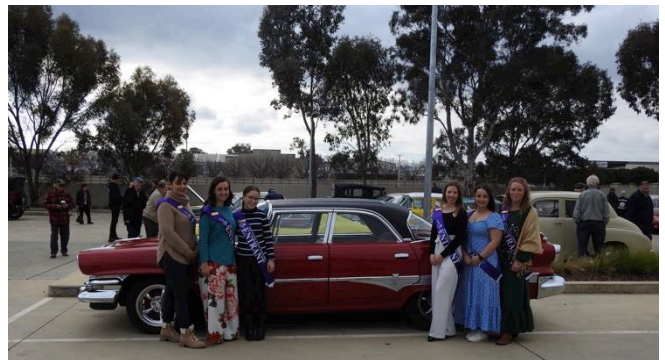
Miss Wagga Entrants braved the wintry day to help out