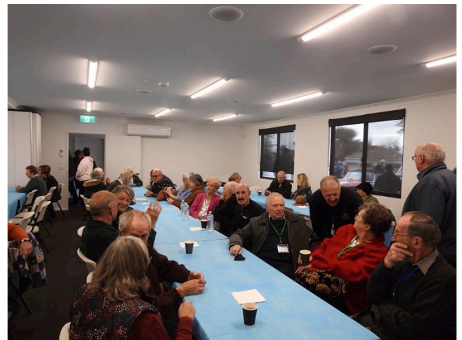
Enjoying a catch up with old and new friends in our new rooms

There was lots of catching up to be done.