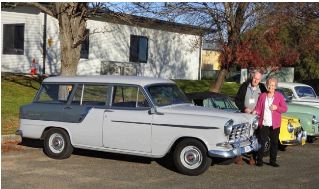
Entrants' cars at the clubrooms