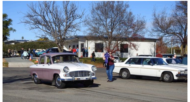
Kelly waving the cars off on the Saturday morning