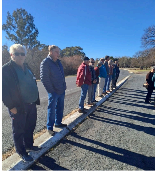
Where else would you stand for a chat in the sun other than the side of a busy road?!