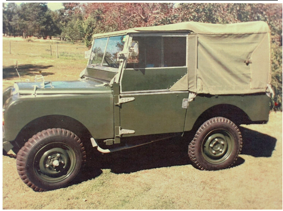
The "Landy" back home