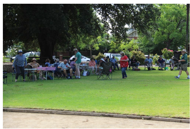
The cool shady park

The relaxed park setting provided the perfect opportunity for members to catch up and enjoy each other's company.