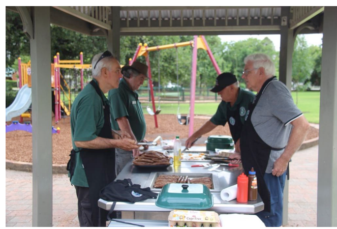
Some busy helpers

On Sunday January 5, 39 club members met at the Club rooms. Most then proceeded on a run around Lake Albert, travelling on Kooringal Rd, Vincent Rd, Kyeamba Ave, Alder Rd, Sycamore Rd, Brunskill Rd, Mitchell Rd to the destination of Butterbush Rd. This is a relatively new area of Wagga with many large houses that most had not seen. This along with a drive in the country was the goal of the route. The return trip was via Lakehaven Dr, and Plumpton Rd.