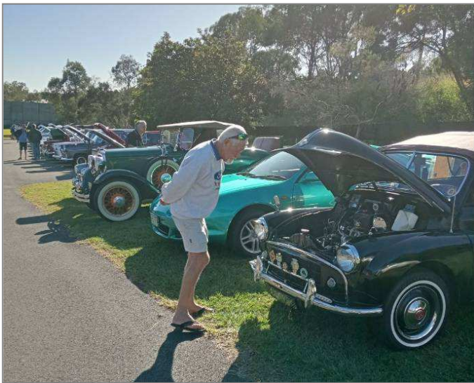
Clubhouse for a chat before heading homeward.