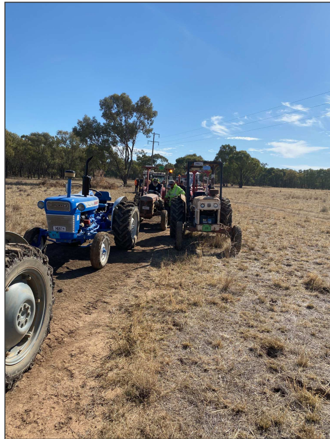
Mud on tyres

Back in Deniliquin and again more fuel. We did 102km's for the day. The evening meal at the Bowling club and speeches from the President of the NHMA as they had held their Delegates meeting just prior to the meal.