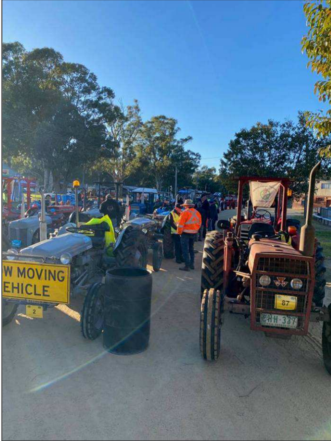
The start of the first day

It was the day to travel to Deniliquin for the trek held over 3 days. We arranged for several attendees from around Bendigo to all meet at Huntly for coffee and a meet up to then travel in convoy.