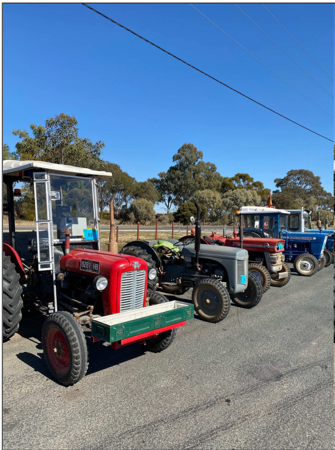
Lunch time parking

We passed a number of large channels that feed to huge travelling irrigators. They are used for the rice and then to grow wheat. Two crops in one year for some. Then onto a main road with a reasonable amount of traffic including a number of trucks. We had space to get off the sealed roadway and even drive left around the white posts meaning we were not impacting on the traffic passing by.