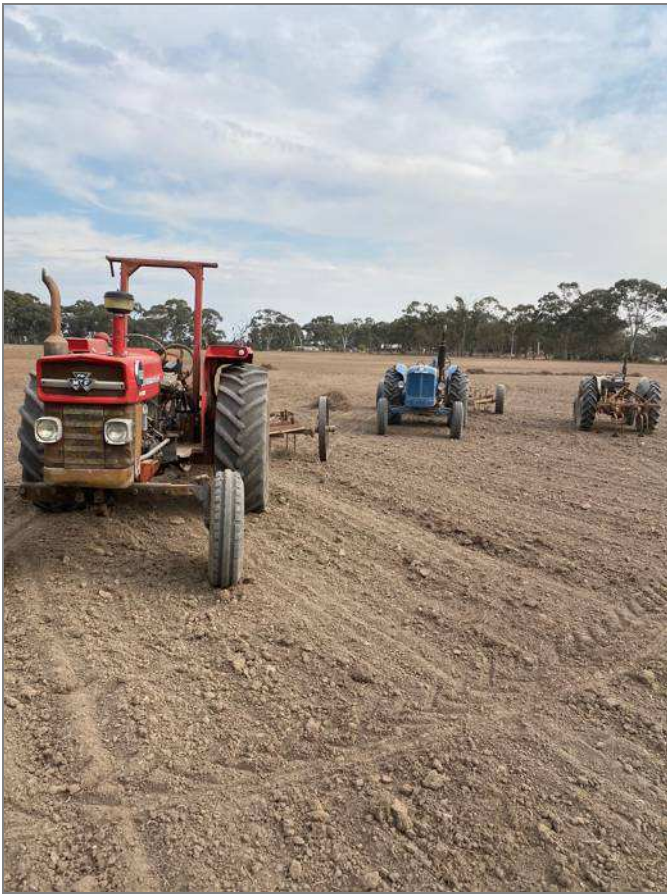
Preparing land in April

The members mainly used pre-1970 tractors and machinery to do all the work. Their end plan was to plant seed oats in it in April this year, to hopefully then grow a crop and harvest that with an old binder and some old mowers and bailers making the smaller bales as they are easier to handle.