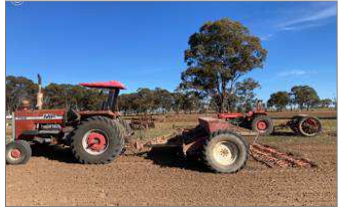
Tractors with seeders

Lots of hours of working and building loading ramps, fixing fences and new gates filled in time between working the property. We also acquired a Shearer seeder; that had a broken drive cog so another seeder was purchased in a lot worse condition and the cog moved over to make one good unit. Then, one of our members purchased an old Massey Ferguson seeder and got it going with a few replacements as well. Both were reset to run the seed and fertilizer at the right rate.