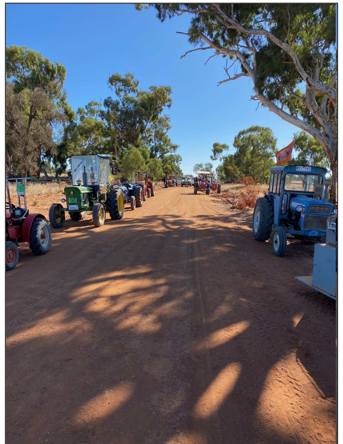
Morning tea stop on the Trek

Start time was soon with us; a couple of reluctant starters were soon sorted out. The plan was for Friday and Saturday to cover nearly 100km's each day so we were all asked to maintain the leaders speed. We were also asked to be aware as there are a number of B-Doubles in Deniliquin as it's the end of rice harvest and just the normal trucks passing through.