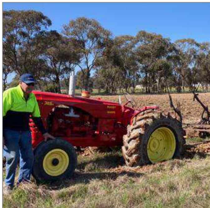
Bogged in September 2023

About 12 months ago the members of Central Victorian Restoration Group located around Bendigo were fortunate enough to be given a lend of 70 acres of land. The club decided to work it up and eradicate the weeds and remove the rocks and clean up some old stumps.