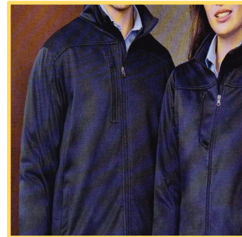
Soft Shell Jacket