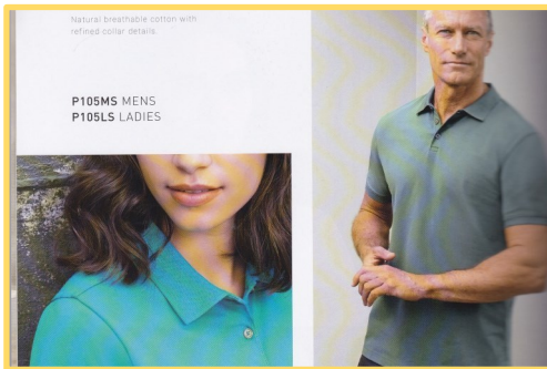
Cotton Polo Shirt