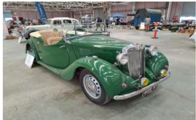
1947 MG Y Type Saloon on display