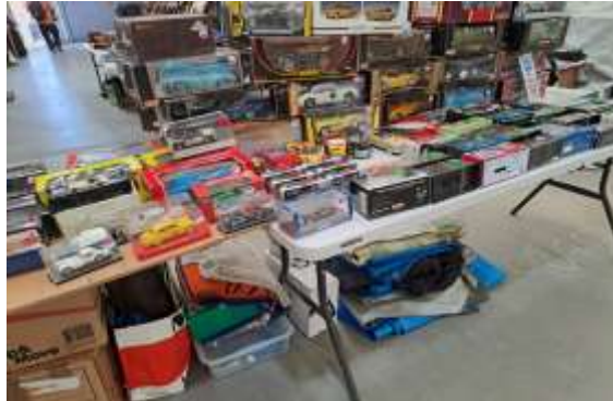
Many options for the model enthusiasts.