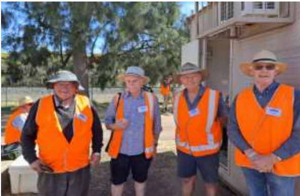
Four Graemes. A keen quartet on the gate!

Warm conditions greeted the many thousands of enthusiasts who attended the 2024 Bendigo Swap. Almost all site holders had set up on Friday afternoon and trading began in earnest at dawn on Saturday. I did a turn on the gate and for two hours witnessed the steady flow of bargain hunters coming in, offset by an out flow people leaving with treasures in hand.