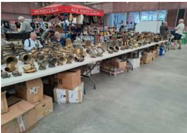
A huge variety of parts to search through. Many Veteran lights to choose from.