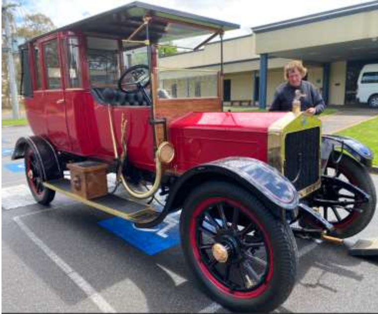
(1911 Alldays & Onions 30/35 6cyl Landaulette).

from NSW). As most newly restored cars do, the Alldays decided that it didn't want to participate for 90% of the rally with, "you guessed it", clutch problems.