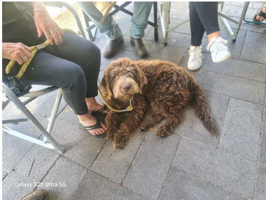
Wilkin Christmas Camp out