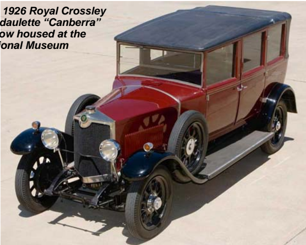
A 1926 Model 18/50hp Crossley type 1L Landaulette 'Canberra' car. Technical specifications include: a 6-cylinder overhead-valve, a 3.8 litre, 2692cc engine; 69mm bore, 120mm stroke cylinder block; a 4-speed gearbox; and 4-wheel drum brakes.

Ministry of Finance reports suggest that, as well as this fleet, other vehicles were needed for the tour retinue: