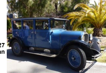
Lachie Jackson's 1927 Dodge Brothers Sedan

Travelled just over 792 miles door to door and returned a fuel consumption of 13.8mpg: not too bad considering the hilly terrain and some circuit work! - Harold Newton