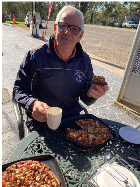
Our President tucking in